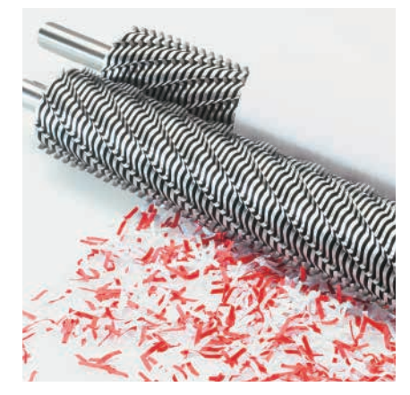
SOLID STEEL CUTTING SHAFTS High grade, hardened steel cutting shafts are milled in our Balingen factory and warranted for life.