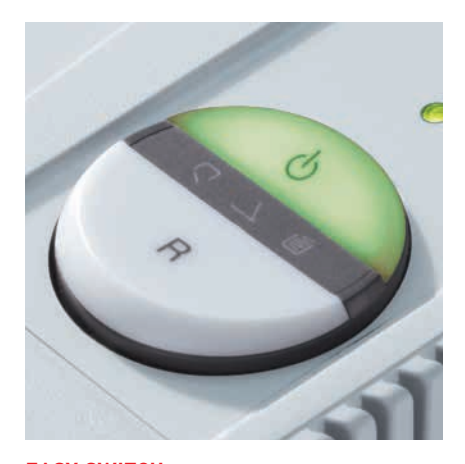
EASY SWITCH Multifunction control element uses optical signals to indicate operational status and functions as an emergency stop switch.