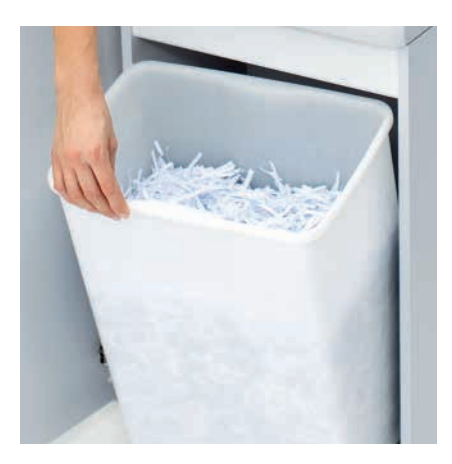
ENVIRONMENTALLY FRIENDLY BIN Durable, lightweight shred bins can be used with or without disposable bags.