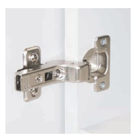
QUALITY COMPONENTS Cabinet doors are equipped with high quality adjustable metal hinges.