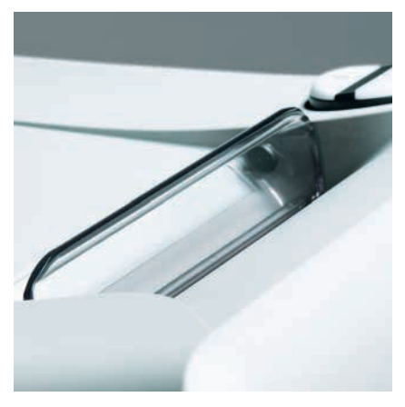
PATENTED SAFETY SHIELD Electronically controlled, transparent safety shield keeps fingers out of the feed opening.