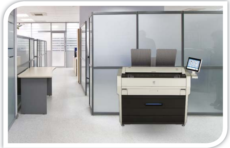
Space Saving Design